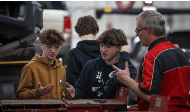
Students participated in MPTC's Automotive Maintenance Class

As we near the end of our first semester, J-term is at the forefront of people's minds. Teachers and students alike look forward to the new experience, which is different from the norm of having eight separate classes. Having one class for an extended amount of time can bring less stress and provide opportunities to learn a lot more about a particular subject.