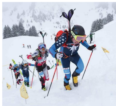
Ski mountaineering, a new sport this year

men's national teams. There will also be more women's sports this year, including double luge and large hill ski jumping. The Olympic Committee aims for this year to be the most gender-