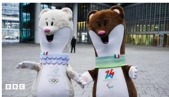
Stoat siblings Tina and Milo, the mascots for the 2026 Winter Olympics

balanced games to this point, with a record high of 47% of the athletes being female. The games' mascots for this year are stoat siblings. Their names are Tina (Olympics) and Milo (Paralympics). Italy is anticipating a full fan presence to be