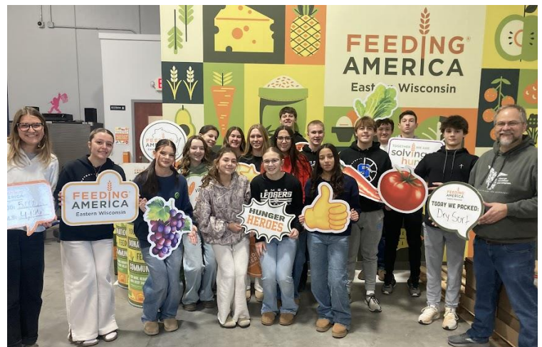
The Have Mercy, Will Serve J-Term Class at Feeding America