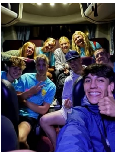
Students on the Costa Rica Trip