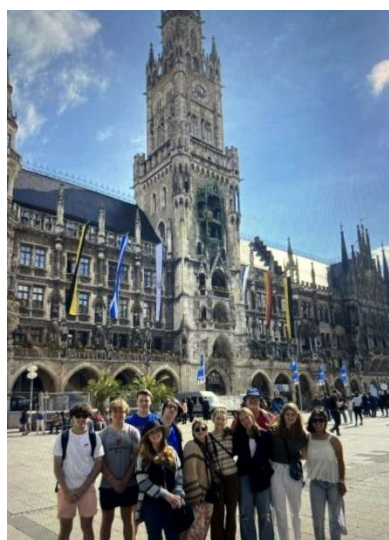
German students at Munich's Neues Rathaus