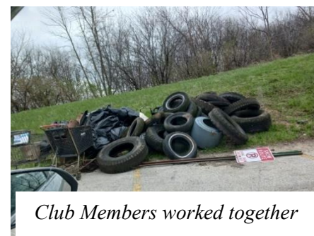
Club Members worked together to pull tires out of a ravine