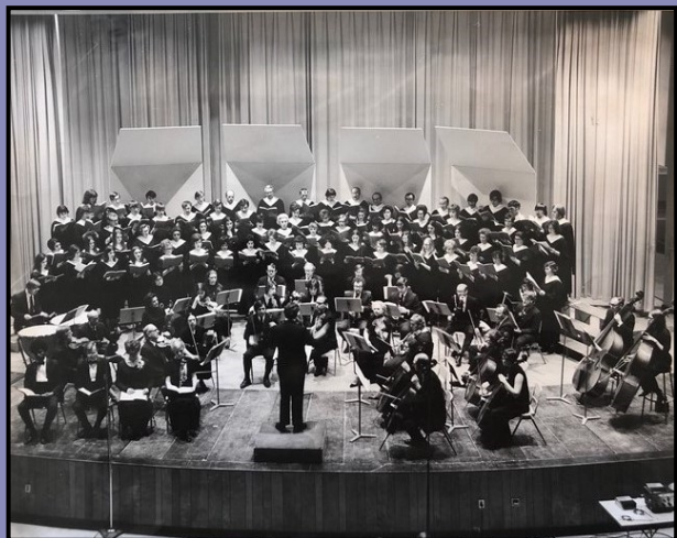
The first Oratorio Concert, May 2, 1971