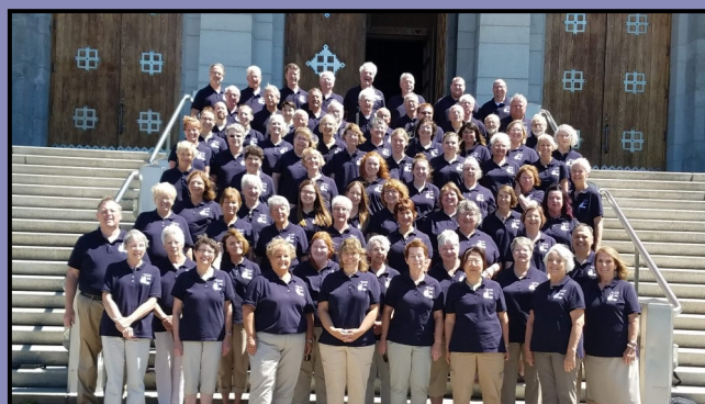
South Shore Chorale trip to Canada, 2018