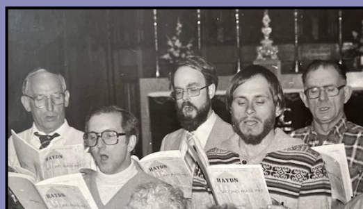
Oratorio members. 1984