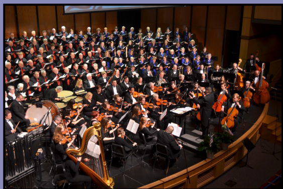
An American Salute Spring, 2018