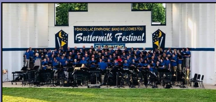
Buttermilk Summer Concert Series Summer, 2018